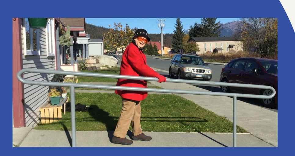
Image Description: A woman in a bright red coat, black hat and eyeglasses uses a handrail to walk out of a house to a street lined with two